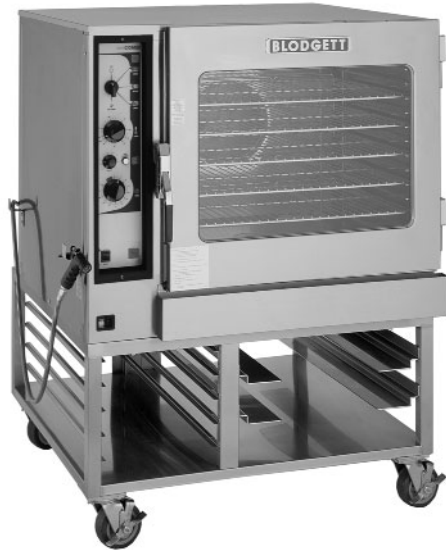
Shown with optional floor stand and casters