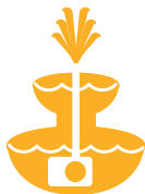
Medium Fountains Up to 3 ft high