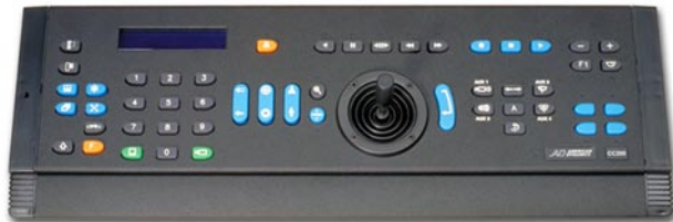
ControlCenter 200 1