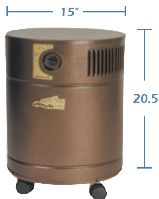
Shipping Weight: 50 lbs

Invest in the health of your family with the AllerAir 5000 Vocarb