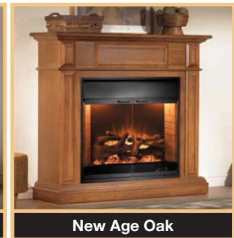
New Age Oak