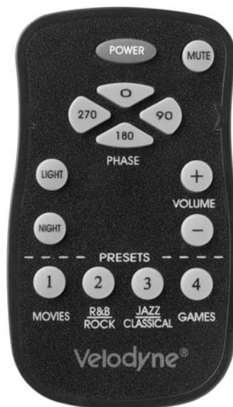
Figure 2: VDR Remote.

Note: The volume can also be adjusted via the buttons on the back panel of the subwoofer. These buttons have the same effect as pressing the up and down volume buttons on your remote. The unit comes preset from the factory with the volume set at 30% of maximum setting.