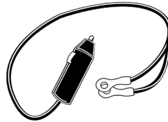
12V Accessory Plug